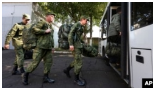
Russian recruits take a bus near a military recruitment center in Krasnodar, Russia, on September 25.

Five Russian citizens have been stranded at the Seoul airport after South Korean authorities rejected their requests for political asylum, local media reported on January 9. The five men fled Russia after they received conscription papers following Moscow's announcement of mobilization to the Kremlin's war in Ukraine. They say they do not want to go to the war and kill Ukrainians. They now are living at the airport while awaiting a court ruling on their appeals against the decision to refuse their asylum requests. To read the original story from RFE/RL's Russian Service, click here .