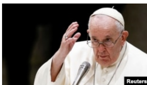
Pope Francis (file photo)

Pope Francis has broken his silence on the nationwide protests convulsing Iran, denouncing the recourse to the death penalty there and seemingly legitimizing the rallies as demonstrations “demanding greater respect for the dignity of women.” Francis made the