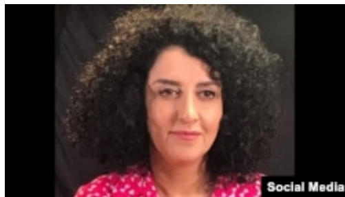
Iran's Narges Mohammadi is one of the recipients of this year's Olof Palme human rights prize.