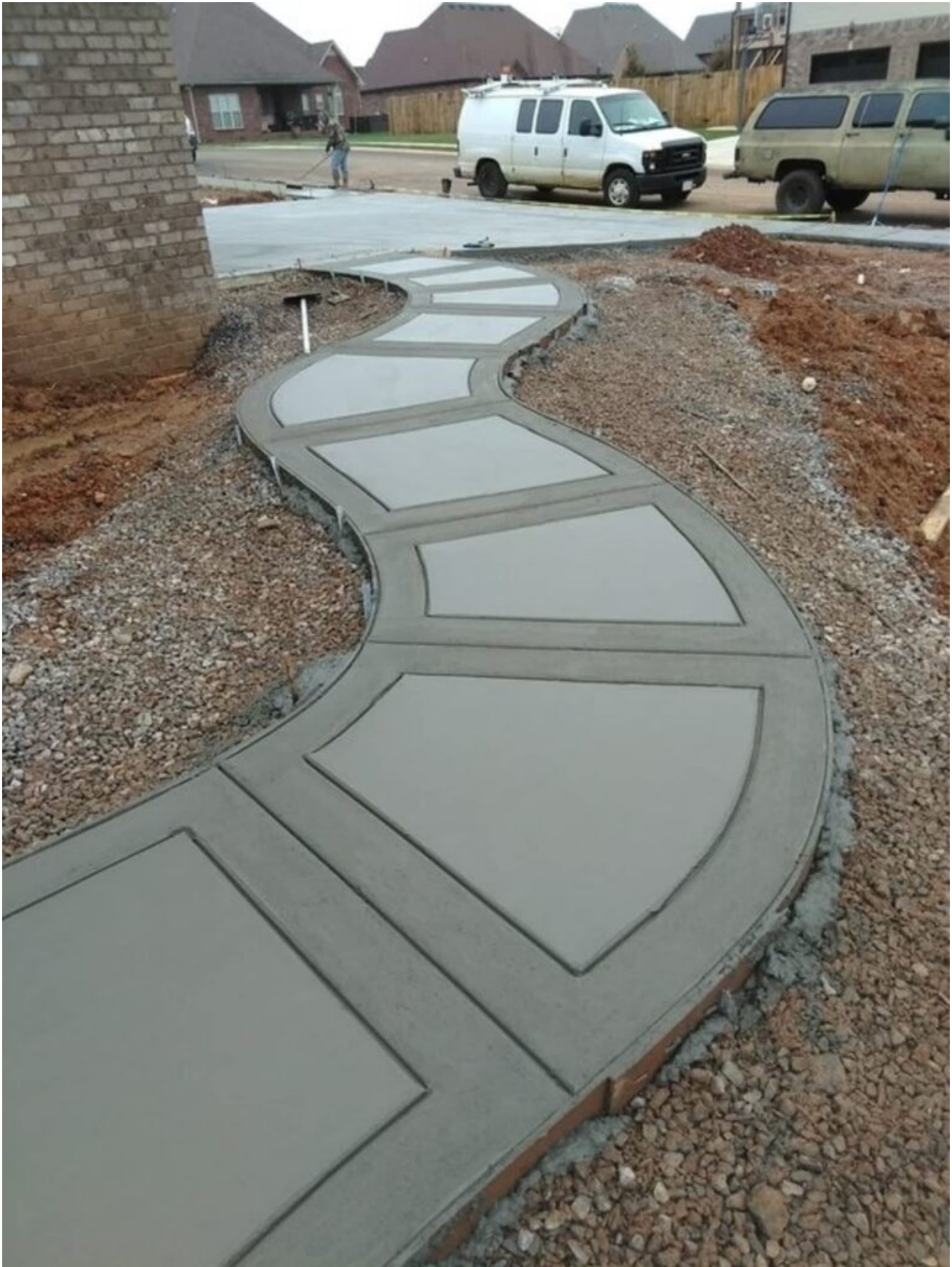
A walkway or garden path enhances a home's landscape and complements its exterior features.