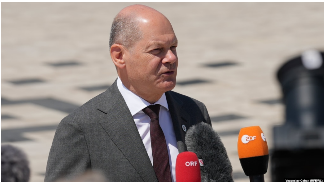
Německý kancléř Olaf Scholz (skladové foto)

Německý kancléř Olaf Scholz zuřivě obhajoval zaslání pomoci Ukrajině poté, co na něj demonstranti křičeli během projevu na shromáždění jeho strany ve Falkensee u Berlína. Demonstranti během Scholzova projevu 2. června vykřikovali fráze jako „warm štoláři“ a „Vytvořit mír bez zbraní“. křičí na něj. Scholz také dal jasně najevo, že nevidí žádnou alternativu k podpoře Ukrajiny, a to nejen v principu, ale také pomocí zbraní, vzhledem k rozsáhlé ruské invazi.