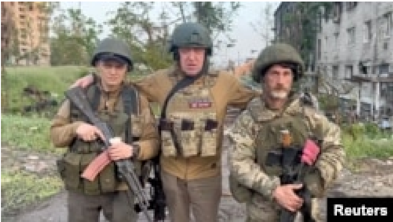
Wagner chief Yevgeny Prigozhin poses in Bakhmut with two of his mercenary fighters on May 25.

In a sign of rising tensions between Russia's Wagner mercenary group and the country's official armed forces, the private company led by Yevgeny Prigozhin has released a video of a captured Russian officer where he "confesses" to ordering an attack on the mercenaries.