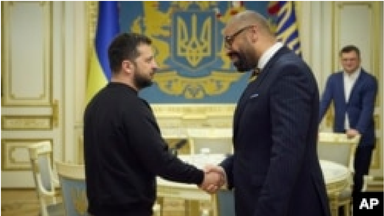
Ukrainian President Volodymyr Zelenskiy (left) shakes hands with British Foreign Secretary James Cleverly in Kyiv on June 5.

Ukrainian President Volodymyr Zelenskiy met with British Foreign Secretary James Cleverly to discuss the upcoming NATO summit, Ukraine's formula for peace, and the scheduled London conference on reconstruction of the war-torn country. Zelenskiy thanked Cleverley for Britain's support following the Russian invasion of February 2022. "We are very grateful for the support the U.K. has provided and continues to provide to Ukraine," Zelenskiy said following the June 5 meeting in Kyiv. In a video on Zelenskiy's Facebook page, Cleverly said that Britain "will continue backing you and your country until you are victorious."