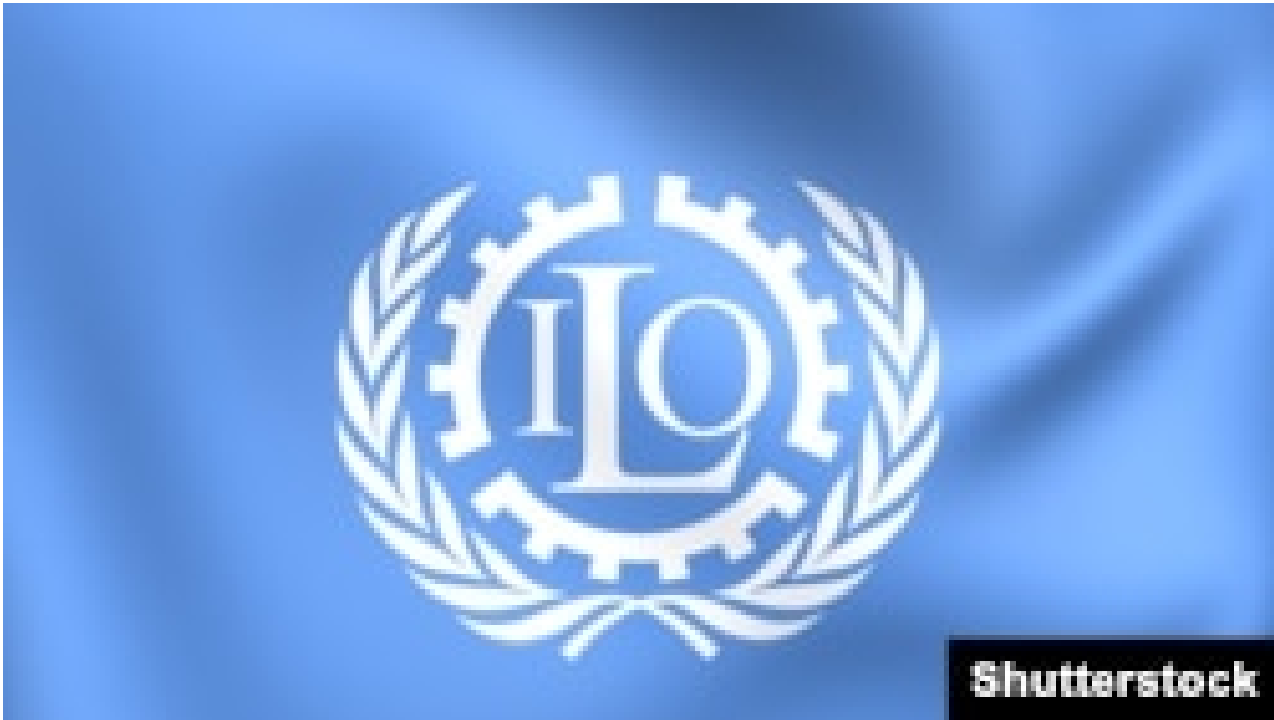
The logo of the International Labor Organization

Eight independent labor organizations in Iran have called for the expulsion of the country from the International Labor Organization (ILO) and its session in Switzerland that starts on June 5.