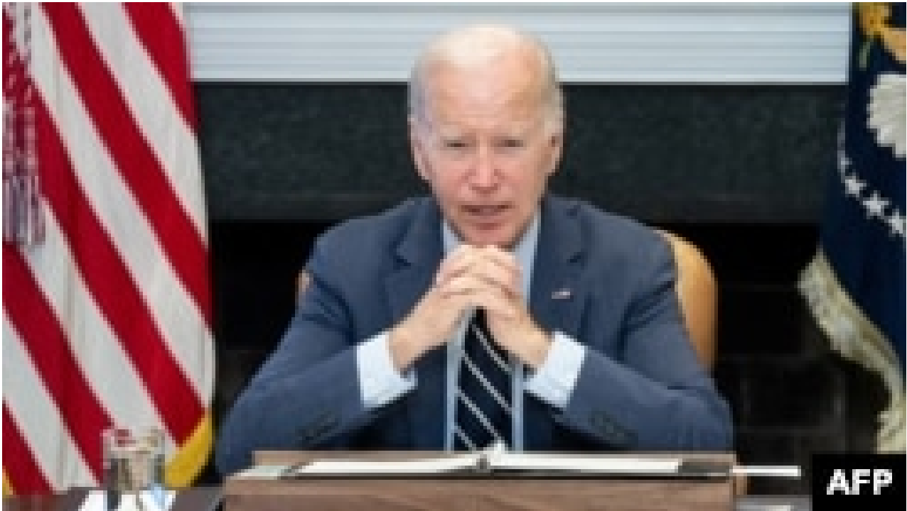
U.S. President Joe Biden makes an address on June 5.

U.S. President Joe Biden thanked Prime Minister Mette Frederiksen on June 5 for Denmark's role in a Western alliance "standing up" for Ukraine as it tries to fend off Russia's 15-month-old invasion. The Oval Office visit kicked off the first of a pair of critical meetings Biden is holding with European allies this week that will focus heavily on what lies ahead in the war in Ukraine -- including the recently launched effort to train, and eventually equip, Ukraine with American-made F-16s fighter jets. Biden on June 7 will meet with British Prime Minister Rishi Sunak. To read the original story by AP, click here .