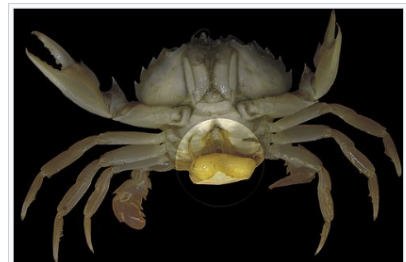
Crab with egg sac of the parasitic barnacle Sacculina carcini . The parasite stops reproduction in its host, the crab, and stimulates the female crab to disperse parasite eggs with the same behavior that she would normally use for her own eggs. [1]

Certain other effects of a parasite on its host may appear similar to parasitic castration, such as the host's immune system diverting energy from reproduction in response to numerous parasites that singly would have no impact on fecundity or fertility , or parasitoids that may consume reproductive organs first. [3]