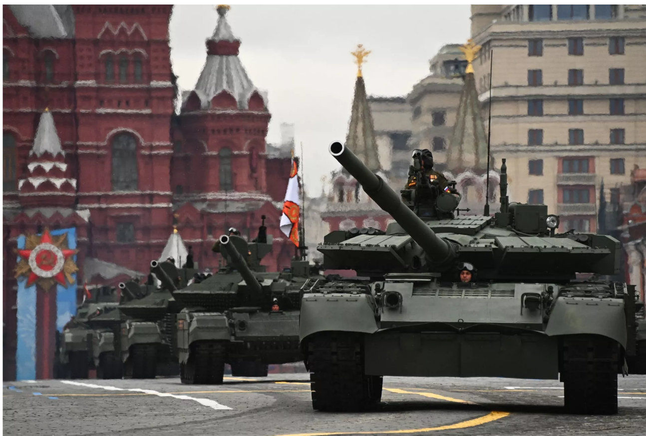
Hlavní bitevní tanky T-72B3M od 1. gardového tankového pluku na Rudém náměstí

Výcvik základního člena americké posádky M1 Abrams trvá 22 týdnů. Tento výcvik jen dává vojákovi velmi základní sadu dovedností, aby byl funkční. Skutečné operační odbornosti lze dosáhnout pouze během měsíců, ne-li let, dodatečného výcviku nejen v samotném systému, ale také jeho zaměstnáváním jako součást podobně vyškoleného týmu kombinačních zbraní. Jednoduše řečeno, ani ukrajinská tanková posádka, která má zkušenosti s provozem tanků T-72 nebo T-64 ze sovětské éry, nebude schopna okamžitě přejít na hlavní bojový tank západního typu.