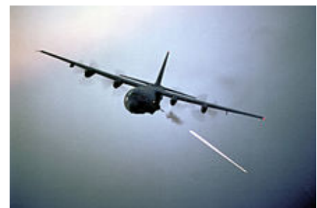
A US Air Force AC-130 Hercules firing its weapons

Médecins Sans Frontières reported that between 02:08 and 03:15 local time ( UTC+04:30 ) on the night of 3 October, the organization's Kunduz hospital was struck by "a series of aerial bombing raids". [11][21] The humanitarian organization said the hospital was "hit several times" in the course of the attack, and that the building was "partially destroyed". [22] It further said the hospital had been "repeatedly & precisely hit" and that the attack had continued for 30 minutes after MSF staff contacted U.S. and Afghan officials. [23][24] The Associated Press reported that US Special Forces were a half mile away from the hospital at the time of the attack, defending the governor of Kunduz province. Likewise, Afghan forces were a half mile away. [25][26]