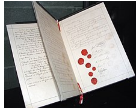
Original Geneva Conventions

Article 11 of Additional Protocol II of the 1949 Geneva Conventions protects hospitals in a non-international armed conflict (which the NATO war in Afghanistan was since June 19, 2002). However, the U.S. is not a party to Protocol II and there is no mention of precautionary measures within the treaty unlike its Protocol I counterpart. [35]