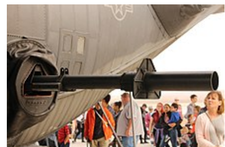
An M102 howitzer on an AC-130